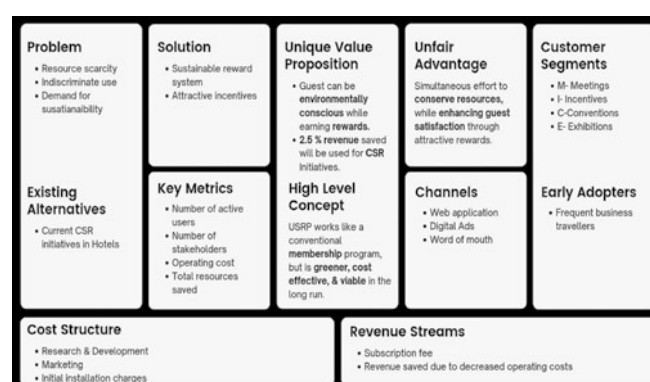
Figure 1: Conceptual framework

The Lean Canvas Model: This matrix takes into account all key areas that need intense brainstorming before a project can be implemented. These include the target customer segments, the problem, its solution, the cost structure, its revenue streams, the business channels, the unique value proposition, an unfair advantage, along with the key statistics that monitor the growth of the project.