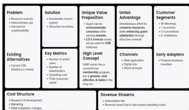
Figure 1: Conceptual framework

The Lean Canvas Model: This matrix takes into account all key areas that need intense brainstorming before a project can be implemented. These include the target customer segments, the problem, its solution, the cost structure, its revenue streams, the business channels, the unique value proposition, an unfair advantage, along with the key statistics that monitor the growth of the project.