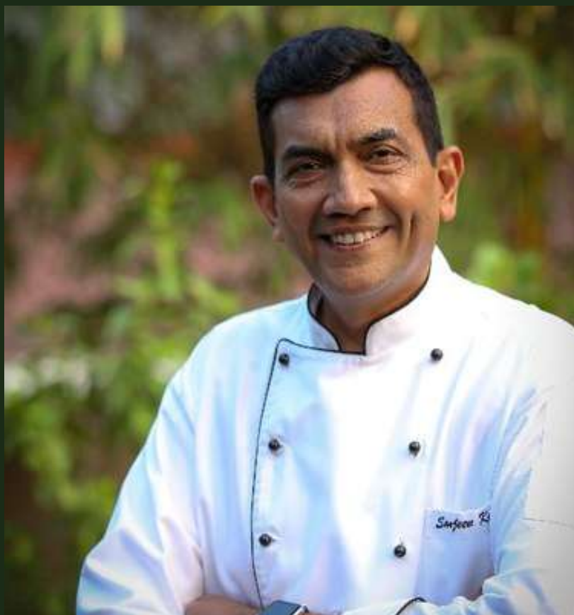
CHEF SANJEEV KAPOOR

He is famous for his iconic television show "Khana Khazana" and his restaurant chain "The Yellow Chilli." His contributions earned him the National Award for 'Best Chef of India' and the Padma Shri in 2017.